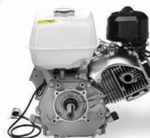
GX390T2 QBP with Standard Q-type PTO