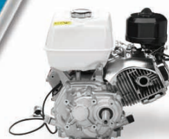
GX390T2 LBP with Enhanced Torque